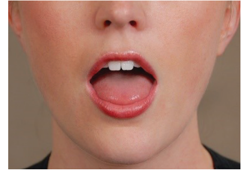
Look at tongue (top, bottom, sides), back of the throat, roof of the mouth and under the tongue using a flashlight and mirror

Visit eBaptistHealthCare.org to learn more about screening and prevention for head and neck cancers.